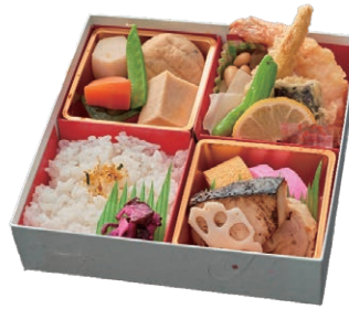
Boxed Lunch with green tea