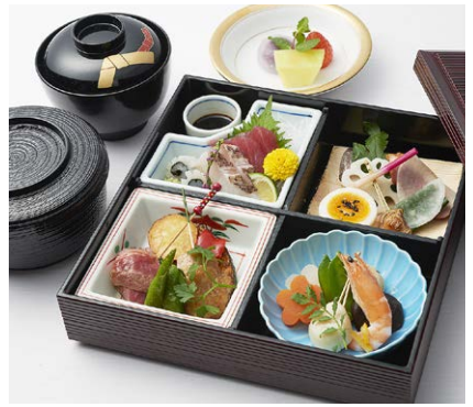
Traditional Japanese Boxed Lunch